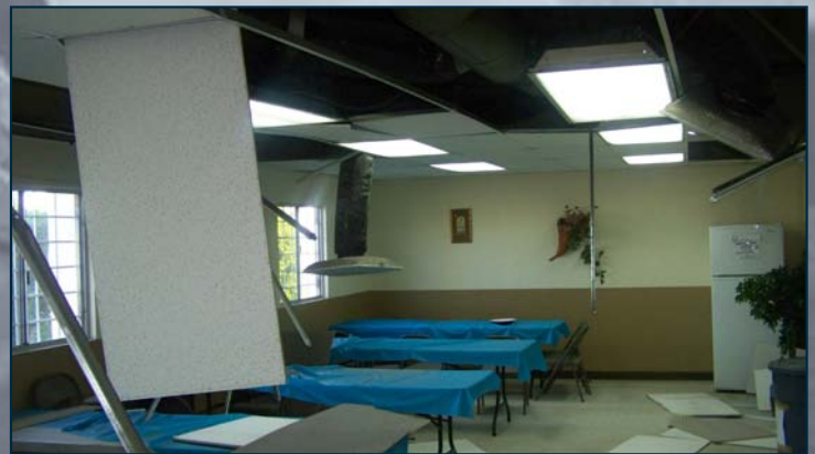
The Dafmex Lunch Room right after the quake

Through hundreds of smaller aftershocks, the clearing of broken waxes was handled over hours on Monday morning, and by that same afternoon, production returned to normal.