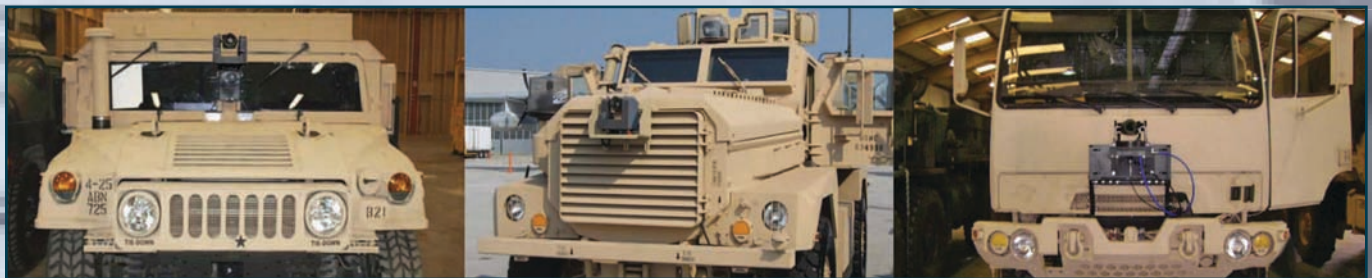
SHOWN ABOVE: The Nightvision scope attached to Military Vehicles.

Dameron is pleased to support our Armed Forces with the manufacture of castings for BAE Systems and their DVE, Driver Vision Enhancer program.