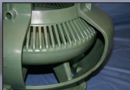
The complex grid is vital to the functioning of the part. The casting is injected in three waxes and poured in one shot.